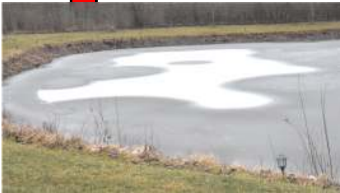
Mother Nature's POND ART