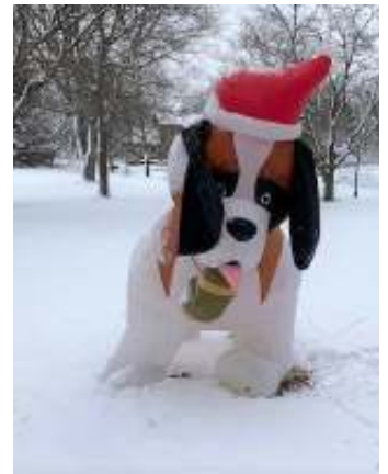
Turn off the wind!!