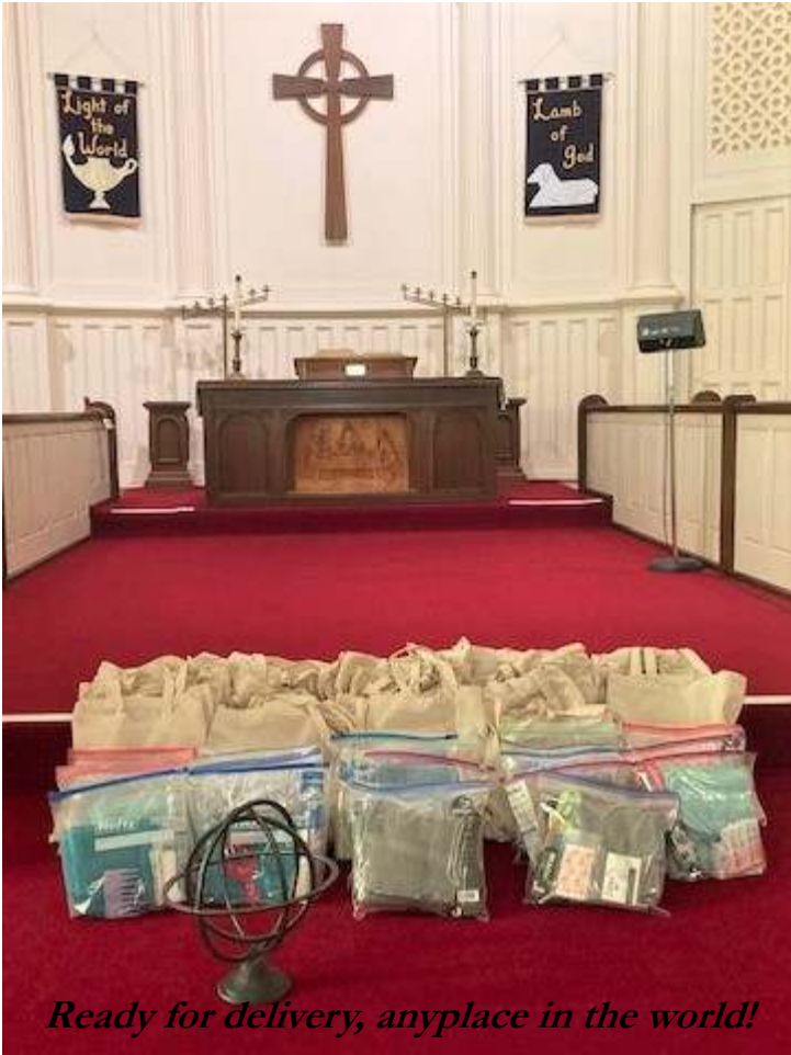
Ready for delivery, anyplace in the world!

PW would like to thank everyone that contributed to the Church World Service effort this year. There are 29 school kits and 22 hygiene kits. This is wonderful. While we do not know what part of the world will receive the kits, we do know that they will help in areas of need. Also, thank you to everyone that helped shop, prepare, serve, and clean-up our Lenten Lunch. It was a successful team effort.